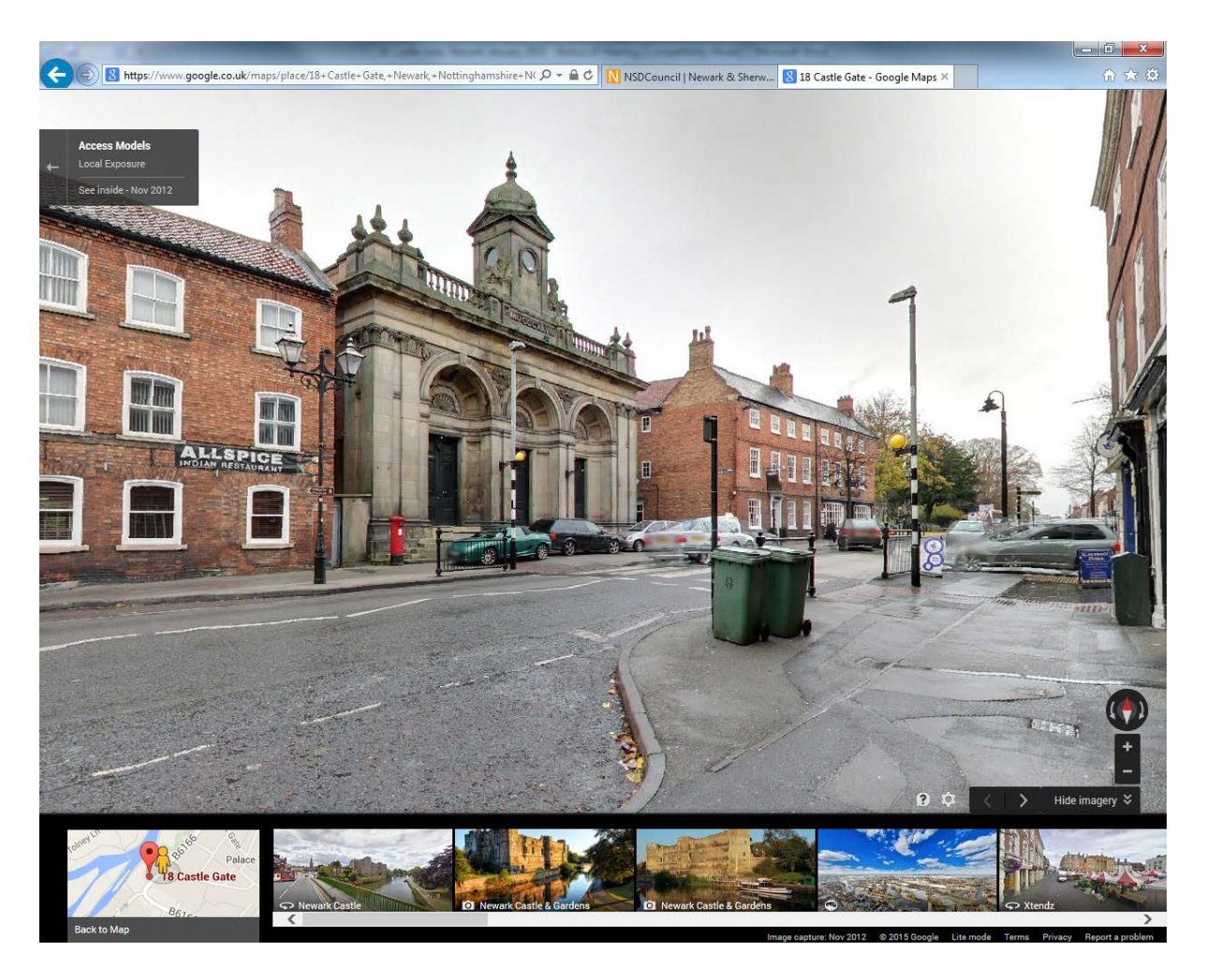
Top photo: 18 Castle Gate – view from Stodman Street, Newak

Bottom photo: 18 Castle Gate – view from west side of Castle Gate